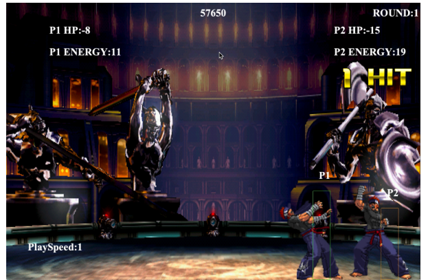
Figure 1: A screenshot of the game in FIGHTINGICE.

FIGHTINGICE [7] is a fighting game platform developed for research purposes at Ritsumeikan University. Figure 1 depicts a typical match of FIGHTINGICE. It provides interfaces in JAVA and Python to get (almost) all pieces of game information needed to allow artificial agents playing the game.