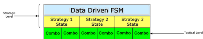
Figure 2. Multi-tiered architecture

The approach used to solve the problem relies on a combination of the techniques discussed previously.