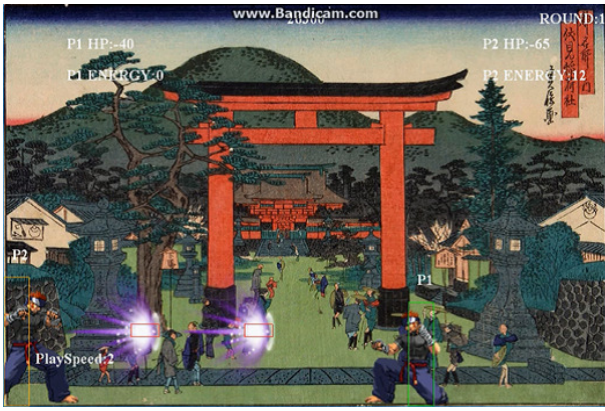
Fig. 2: Screenshot of FightingICE

2014 [7] and for research [6, 11-23]. Because FightingICE has been originally developed from scratch without using a ROM emulator and publicly made available, there are no legal issues to be concerned. In FightingICE, one game consists of three 60-second rounds, and one frame lasts 1/60 seconds. Each character has to decide and input an action in one frame. The HP for both characters is initially set to HP_{max} and it decreases when the corresponding character is hit. When the play is conducted for 60 seconds or either of the two characters' HP becomes 0, the game will proceed to the next round unless the current round is the 3rd one, after which each character's HP will be reset to HP_{max} . The character with the larger remaining HP at the end of a round is the round's winner. In our experiment, the value of HP_{max} is set to 400 according to the rule of Standard Track of FTGAIC.